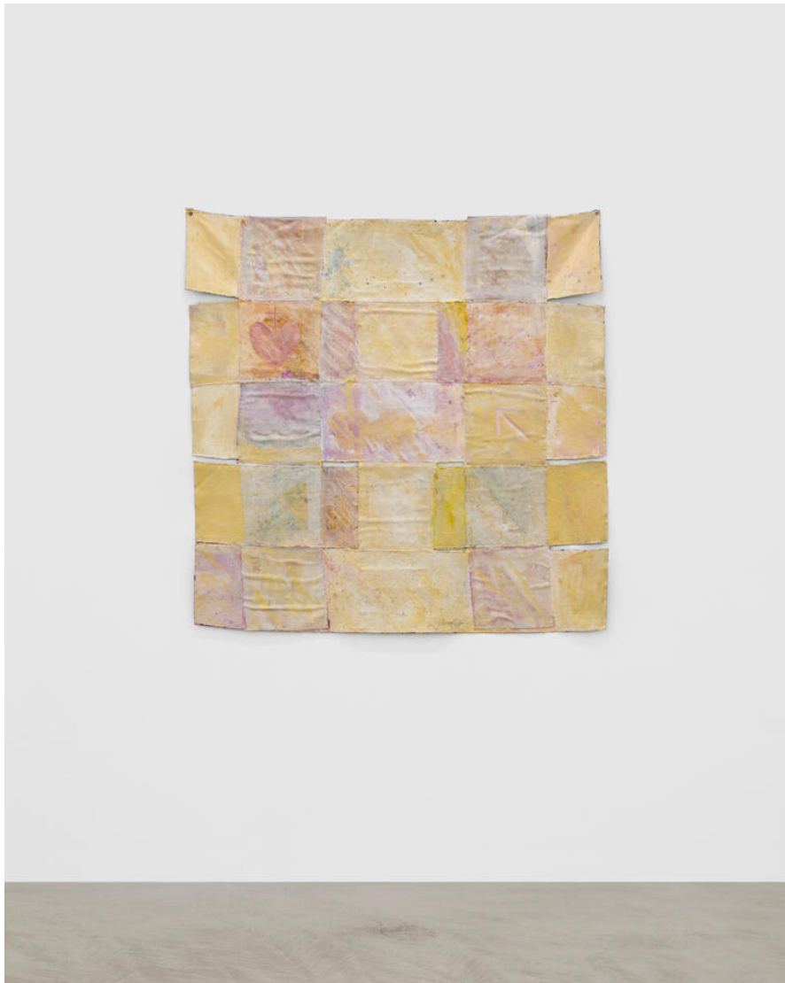
Alonzo Davis, King's Peace Cloth , 1985, acrylic on woven canvas, 1.4 × 1.4 m. Courtesy: the artist and Parrasch Heijnen, Los Angeles

The wall-based works in the exhibition were all made between the mid-1980s and the mid-1990s. Evading categorization either as paintings, collages or sculptures, they were made by weaving strips of painted paper or canvas. As the works became larger – as with the tasselled and roughly painted Celebration with Melon (1986) – so too did the width of the strips. Despite the series's name, none approaches the usefulness of a blanket, though they recall quilts. With one exception, they are all loosely woven – sometimes the white wall peeks through – and unfixed at their edges. Comfort, here, is spiritual, not physical.