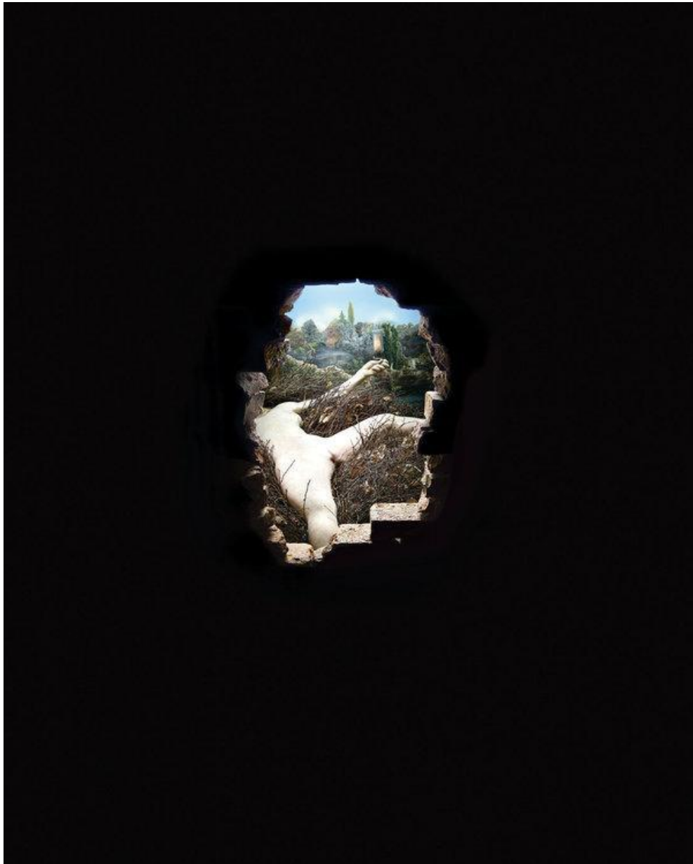
Marcel Duchamp's final piece, "Étant donnés," which he worked on in secret for 20 years.

These kinds of efforts have long been acknowledged as much for the otherworldly patience they require as for their artistry. But in an era of digital hyperdrive, the meticulous, even tedious work that once went into art has been largely replaced by a keystroke, and attention spans have shrunk to virtually nothing. The notion of a contemporary artist pledging fidelity to a single work over decades now seems even more heroic.