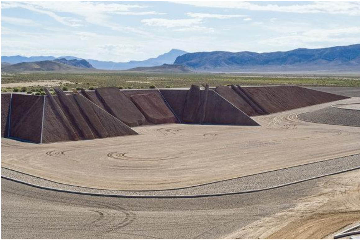
Michael Heizer's "City" has been a work in progress since the 1970s.

THOUGH ALL ARTISTS can be given to meditating on a piece for longer than might seem rational or sane, it is the so-called land artists like Smithson and Holt, minimalist sculptors who left New York in the 1960s for the open, malleable vistas of the American West, who remain the poster children for creative endurance, in part because of the nature of their particular obsession. Making works that can be seen from the stratosphere and can outlast the elements means blasting through rock and transporting endless tons of soil. Walter De Maria , whose 1977 "The Lightning Field" comprises 400 pointed steel poles in a 1-mile-by-1-kilometer grid on a plain in New Mexico, once joked that his "paintbrush is the Caterpillar."