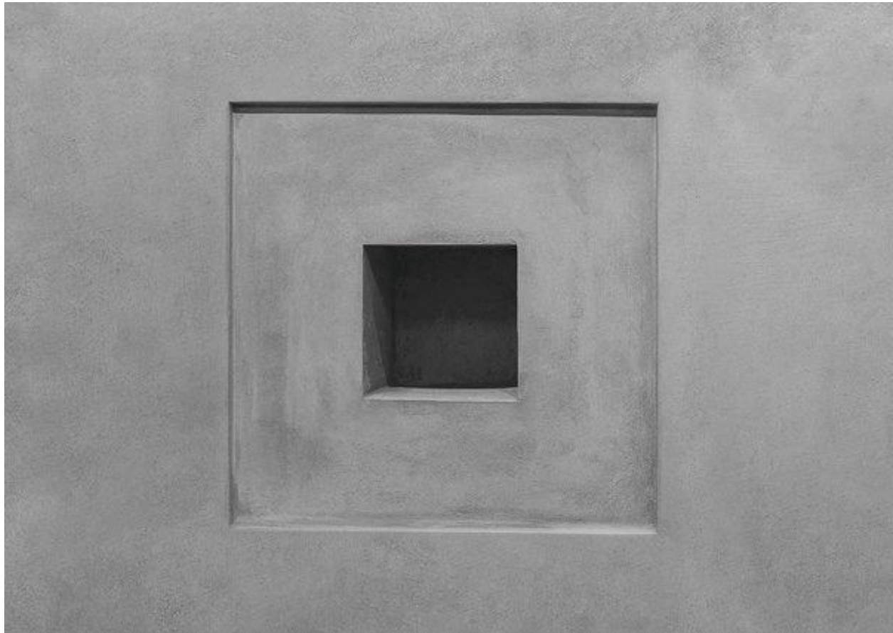
A compartment in Moscow’s Garage Museum of Contemporary Art reserved for Taryn Simon’s “Black Square XVII,” which is expected to be completed in 3015. Credit “Black Square,” 2006–, Void for artwork, Permanent installation at Garage Museum of Contemporary Art, Moscow © Taryn Simon. Courtesy of the artist and Garage Museum of Contemporary Art, Moscow

the New Mexico desert, Ross, the most accessible and voluble of the three men, insists that the project he began 47 years ago will be done by 2022. (But, he concedes, “I’ve been saying it will be finished in three or four years for 20 years now.”) By many accounts, he does seem close to finishing the work, which can host six people at a time in a guesthouse on the property. One by one, visitors will scale the thousands of steps up an ascending tunnel toward an opening that will align them with the earth’s axis, witnessing the progression of the stars over a cycle of 26,000 years. Although he has private support, last year Ross sold his Manhattan loft to partially finance a foundation that will maintain the site for perpetuity.