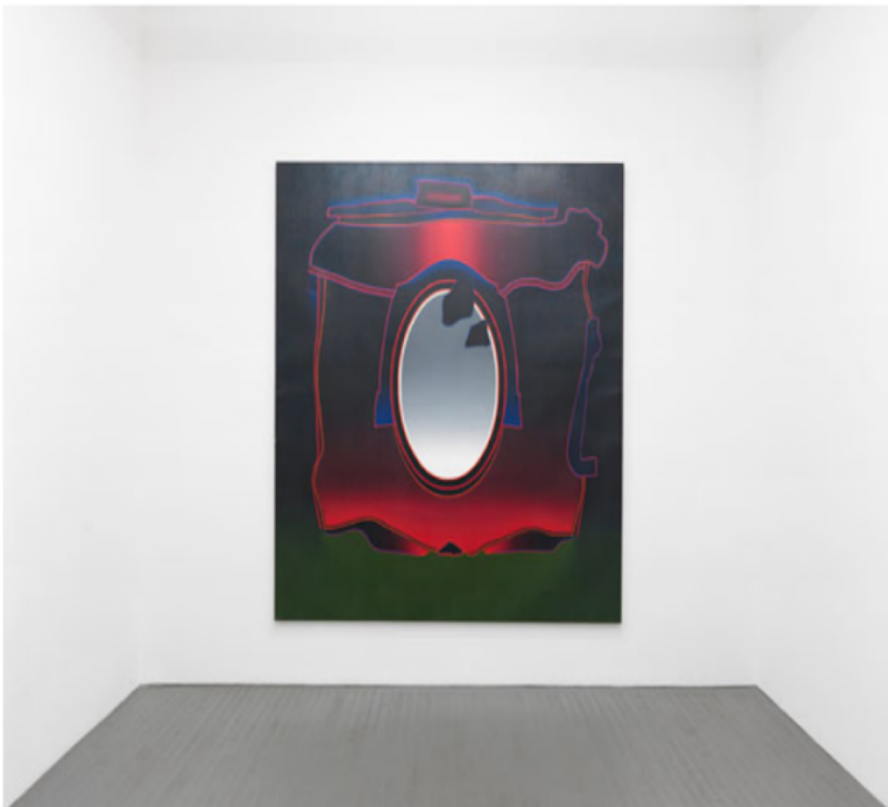
Deborah Remington, Dorset, 1972. Oil on canvas, 91 x 87 inches.

Deborah Remington 1963-1983 at WallSpace June 26 to August 7, 2015 619 West 27th Street, between 11th and 12th avenues New York City, (212) 594-9478