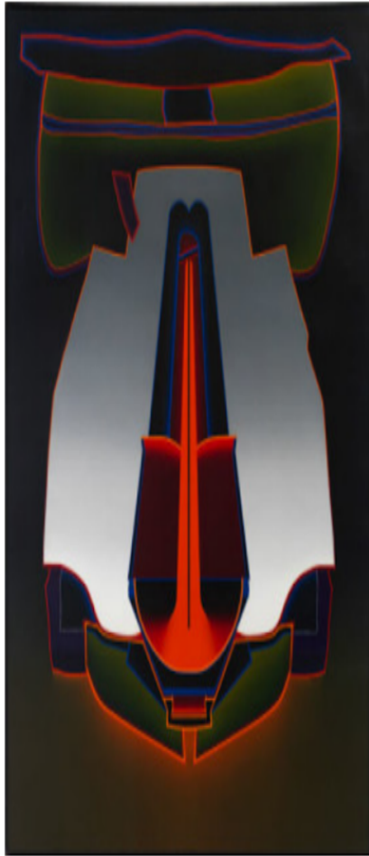
Deborah Remington, Memphis, 1969. Oil on linen, 60 x 53 inches.

whose purely visual elements feel both tangible and psychologically compelling. She paints hieratic forms that suggest machined devices, architectural diagrams, interiors of the body, shields, and emblems. In their ambiguity, the possibilities inherent in the imagery keep opening up multiple readings of exposed cross-sections, places of refuge, routes of escape, and at times, majestic flowerings.