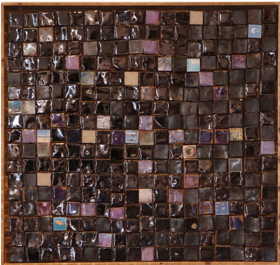
Maddy Parrasch, Untitled (2018), ceramic tiles on wood.