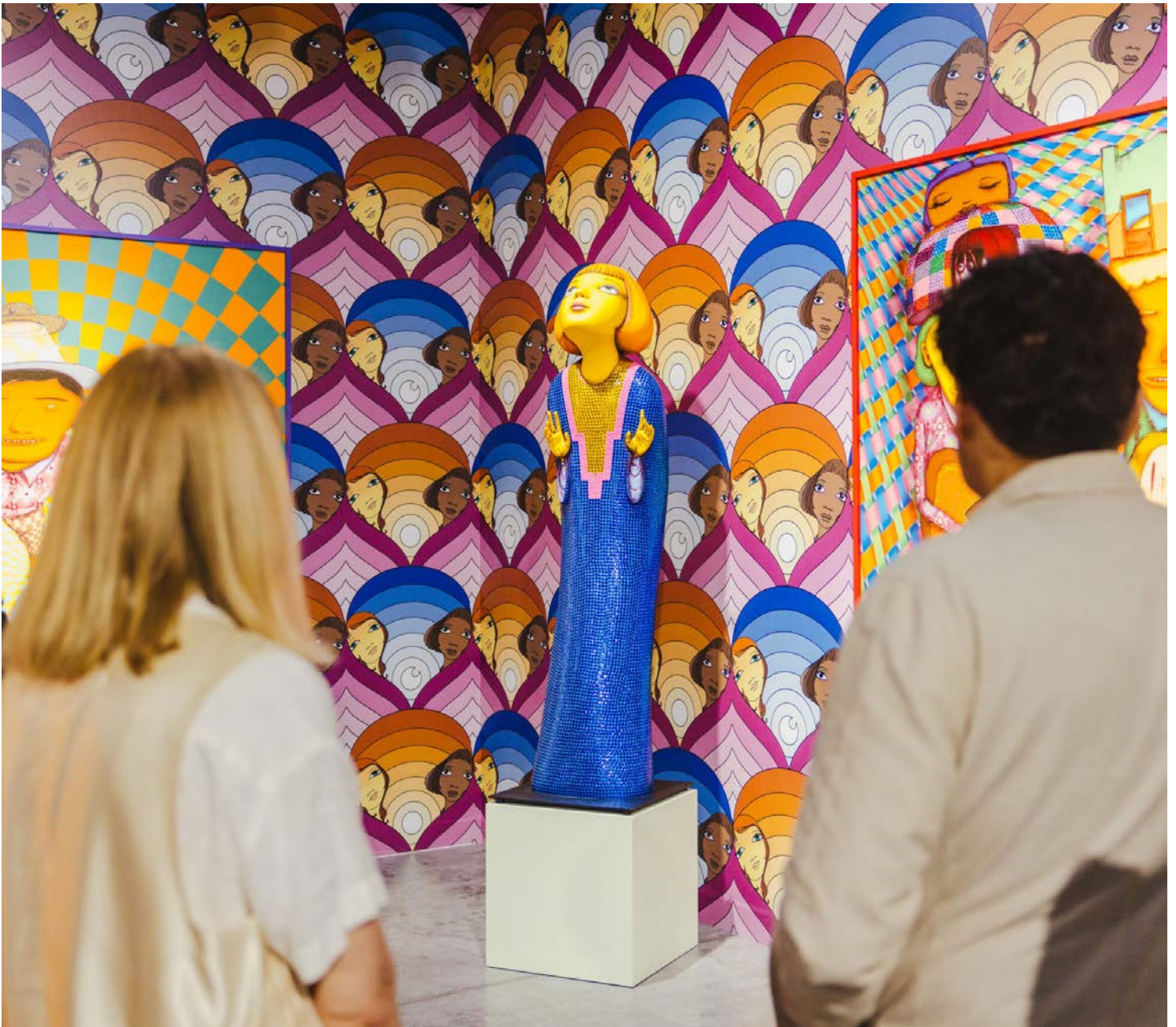
Basel Miami Beach