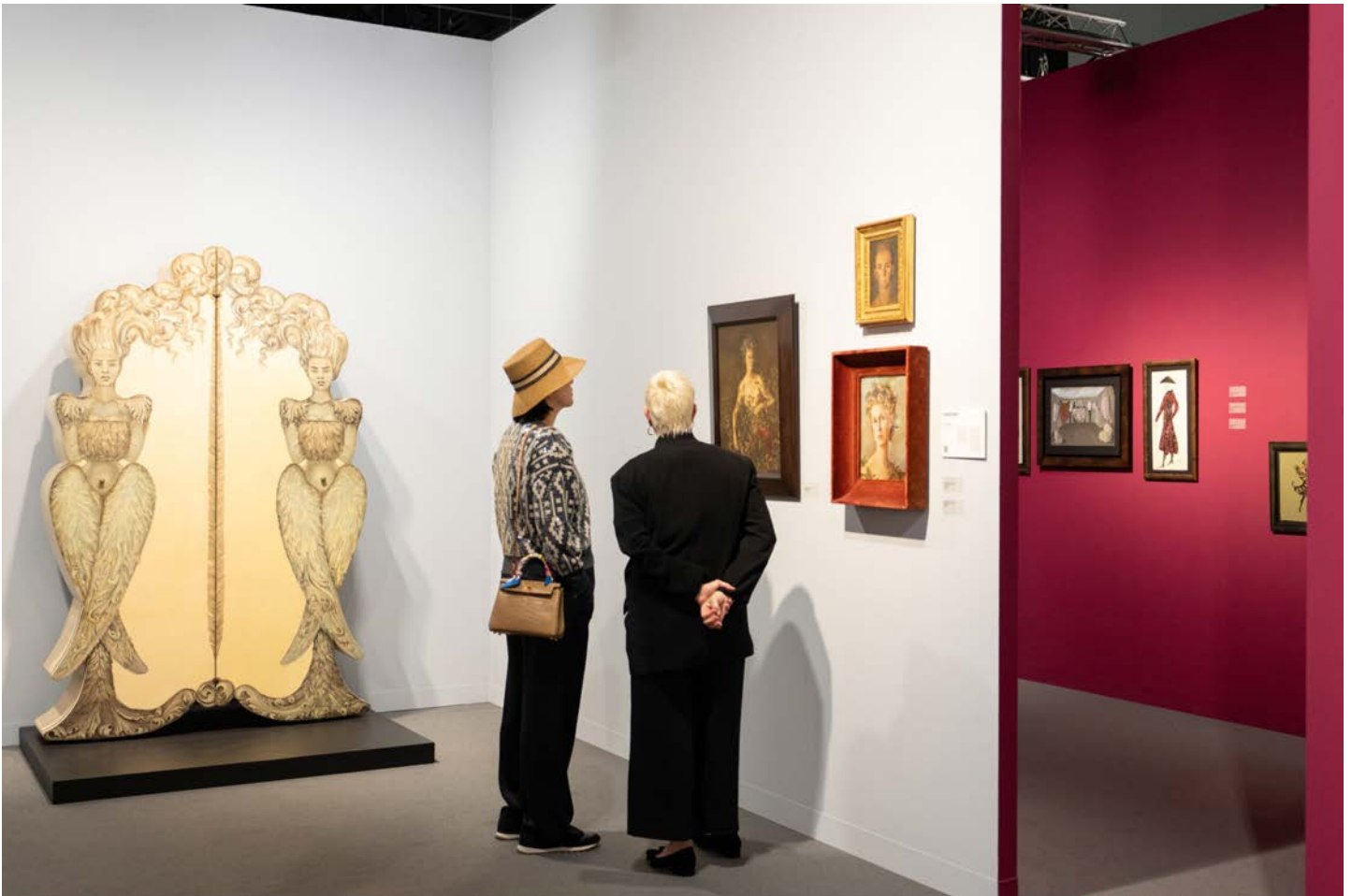
Galerie Minsky and Weinstein Gallery at Art Basel Miami Beach