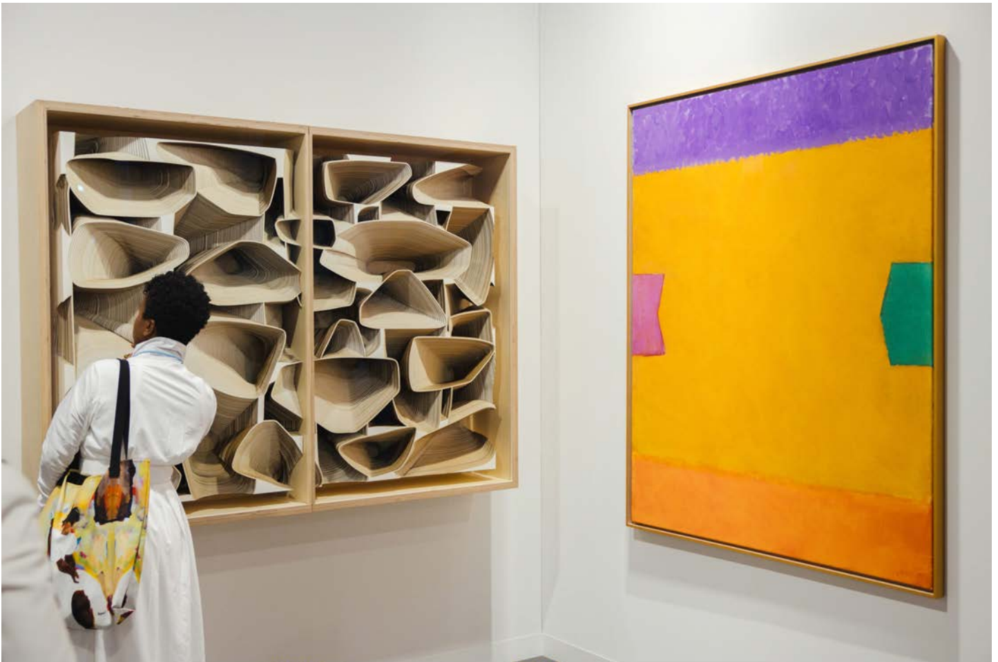
Nara Roesler at Art Basel Miami Beach