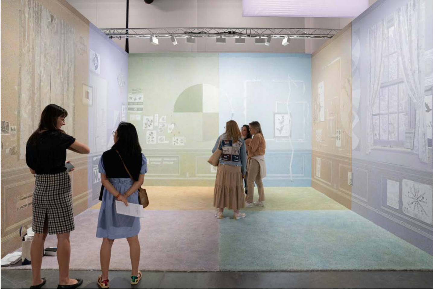
56 Henry at Art Basel Miami Beach

installation presents new works by twin brothers Gustavo and Otavio Pandolfo, known for their long-limbed yellow characters, combining traditional elements of their Brazilian culture with iconography from graffiti, music, and international youth culture.