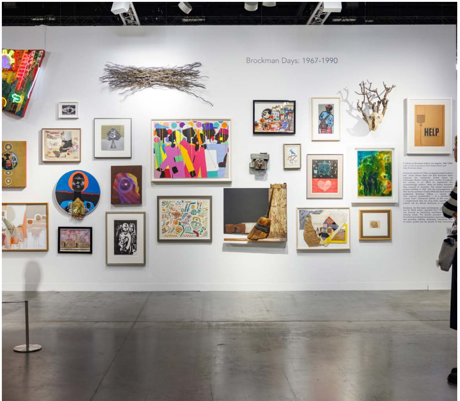
Basel Miami Beach