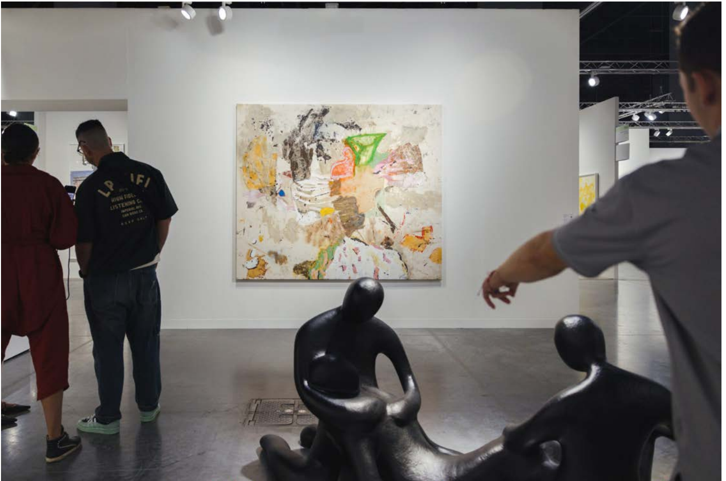
Gallery OMR at Art Basel Miami Beach