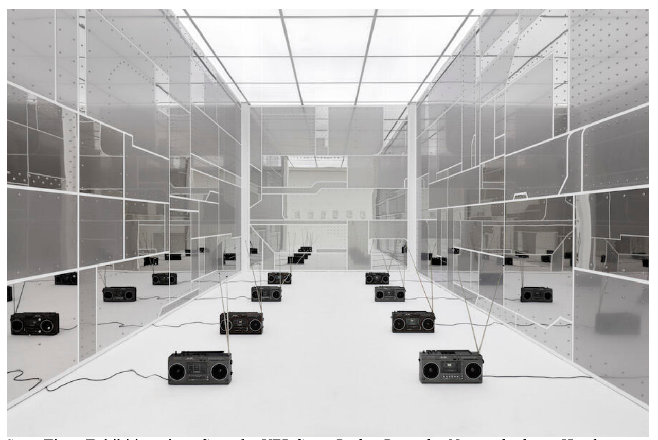
Sung Tieu, Exhibition view, Song for VEB Stern-Radio, Preis der Nationalgalerie, Hamburger Bahnhof - Museum für Gegenwart, 2021, Berlin, Photo by Hans-Georg Gaul, Courtesy Sfeir-Semler Gallery and the artist

performative space as a symbolic place of struggle, resistance, and social ascension (Fortes D'Aloia & Gabriel, São Paulo, Booth B15).