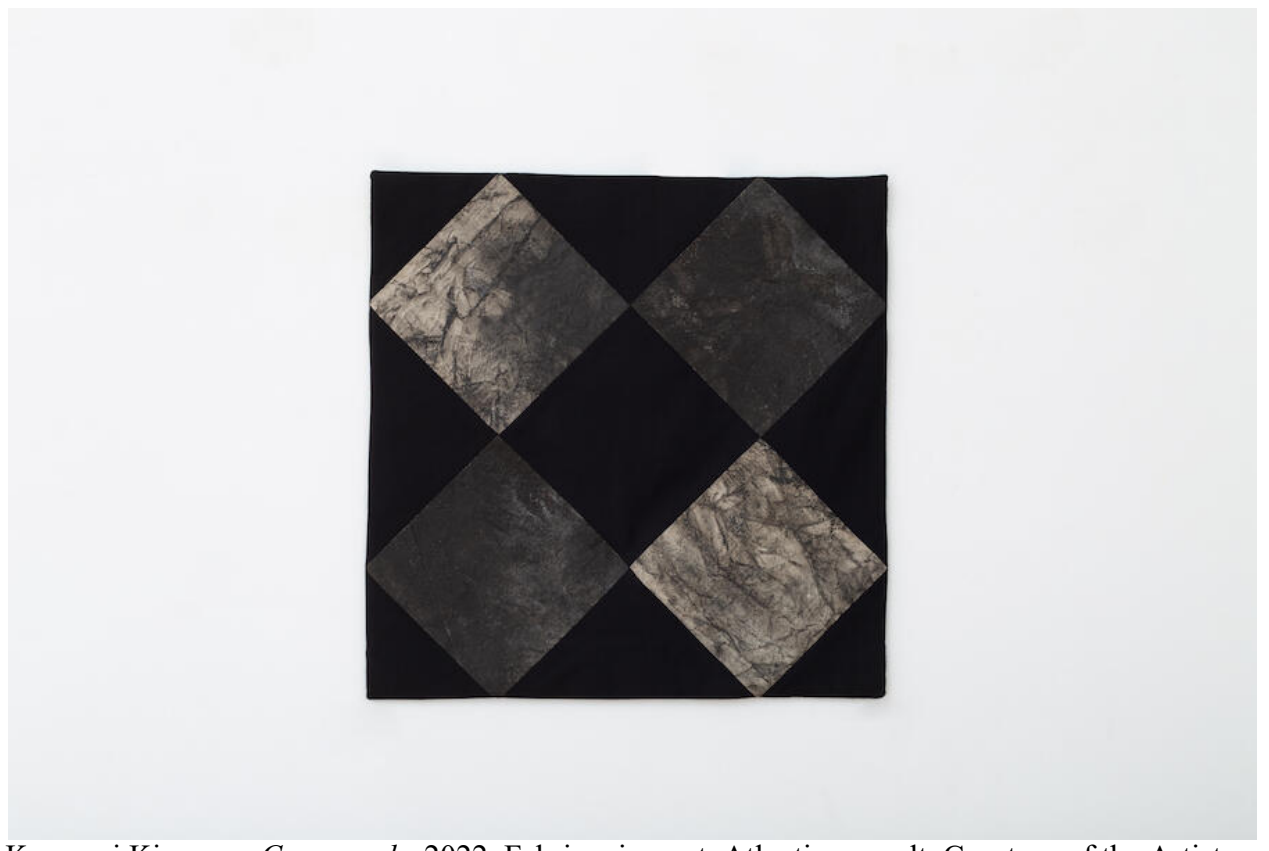
Kapwani Kiwanga, Crossroads , 2022, Fabric, pigment, Atlantic sea salt, Courtesy of the Artist and Goodman Gallery