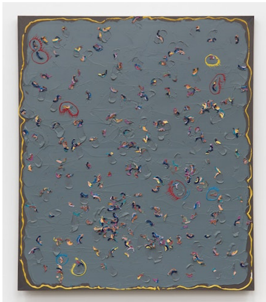
Cynthia Carlson, Bitchy Virgin , 1975. Acrylic on canvas, 70 x 60 inches.