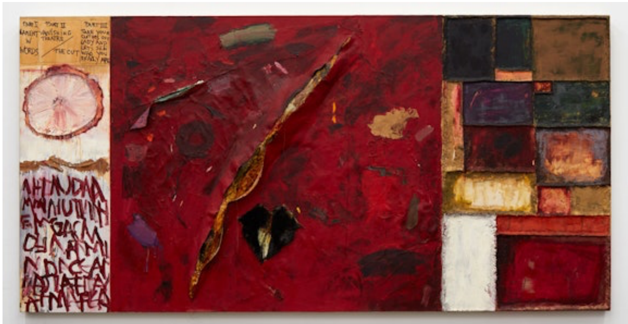
Joan Snyder. Vanishing Theater/The Cut , 1974. Oil, acrylic, paper mache, thread, fake fur, paper, chicken wire on canvas, 60 x 120 inches. Courtesy the artist. Image courtesy KARMA.

When I arrive at a large mixed-media painting by Joan Snyder titled Vanishing Theater/The Cut (1974), my thoughts line up. This visceral composition is structured as a triptych, with one panel emphasizing language, one violence, and one order. At the center, there is a deep cut. It is hard not to think of this violent gesture as representative of the abusive relationship between women and the history of painting as it has been claimed by men. What did it mean for artists to identify as women between 1971 and 1983? I believe that to a great degree it meant reclaiming a genealogy of male repression.