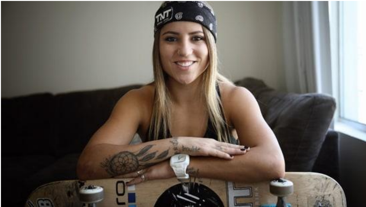
Leticia Bufoni on the Perils of Skating Naked

Brazil's skateboarding sensation has plenty to say about her critics, posing nude for ESPN and getting set on fire.