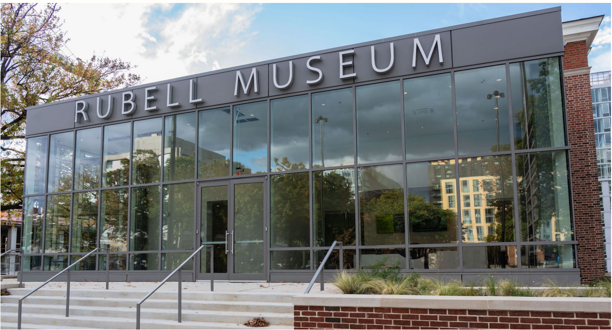
The main entrance to the new Rubell Museum DC, designed by architecture firm Beyer Blinder Belle

The last major museum to open in Washington, DC, the Smithsonian Institution's spectacular, hulking National Museum of African American History and Culture in 2016, was the product of a process that required the US Congress passing legislation, the raising of hundreds of millions of dollars and more than a decade of planning and advocacy. The Rubell Museum DC, which opens to the public