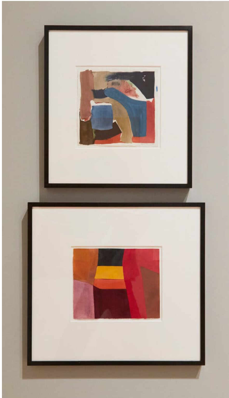
Fanny Sanín's pictures "Watercolor No. 4 (2)" (1968), top, and "Watercolor No. 8" (1968), bottom.