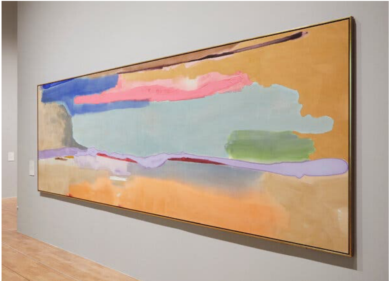
The Whitechapel show opens with “April Mood” (1974) by Helen Frankenthaler.