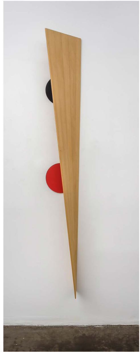
Ectoplasm Should Not Be Too Kinky , 1982, acrylic on canvas, 52-1/2 x 50 x 4 inches