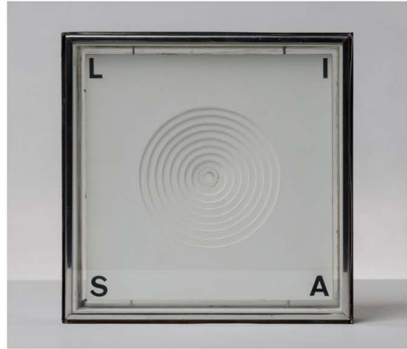
Mona Lisa , 1962, wood, glass, Plexiglas, acrylic, chipboard, 9-1/2 x 9-1/2 x 2 inches