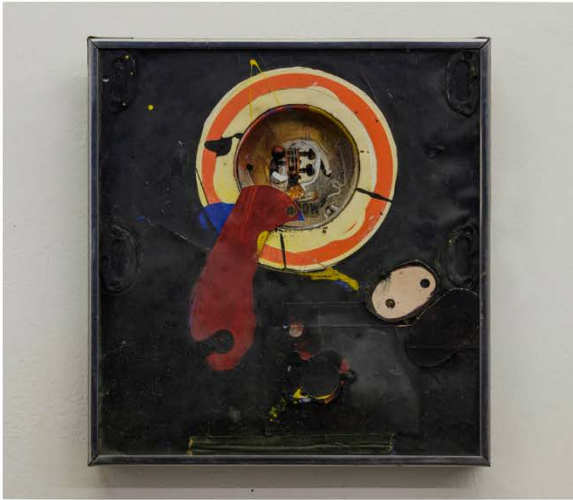
Throw , 1961, mixed media, 19 x 23 inches