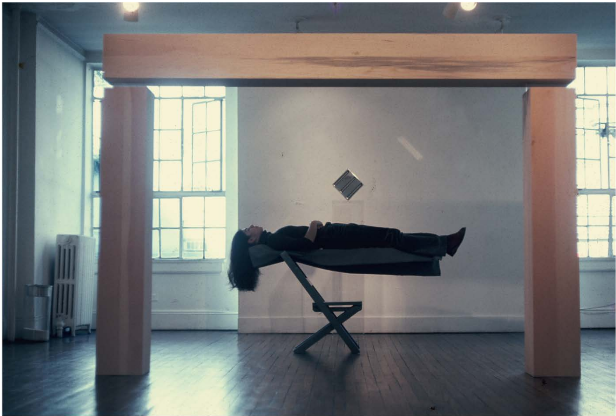
Floating Lady III , 1972, Robert Elkon Gallery