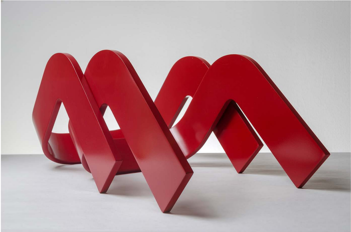
Mabel At the Wheel , 1966, acrylic, plastic and lacquer, two pieces each measuring 12-3/4 x 12-3/4 x 12-3/4 inches

AQO: What are some of the most unconventional materials you've worked with?