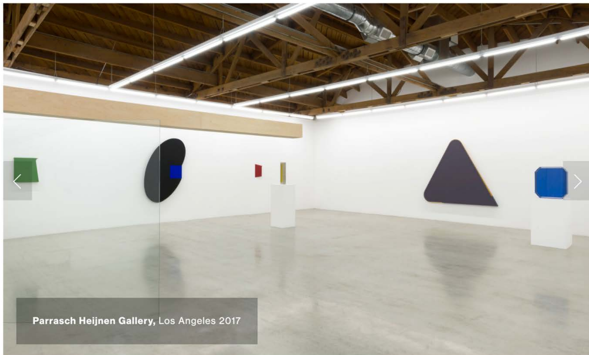
Parrasch Heijnen Gallery, Los Angeles 2017