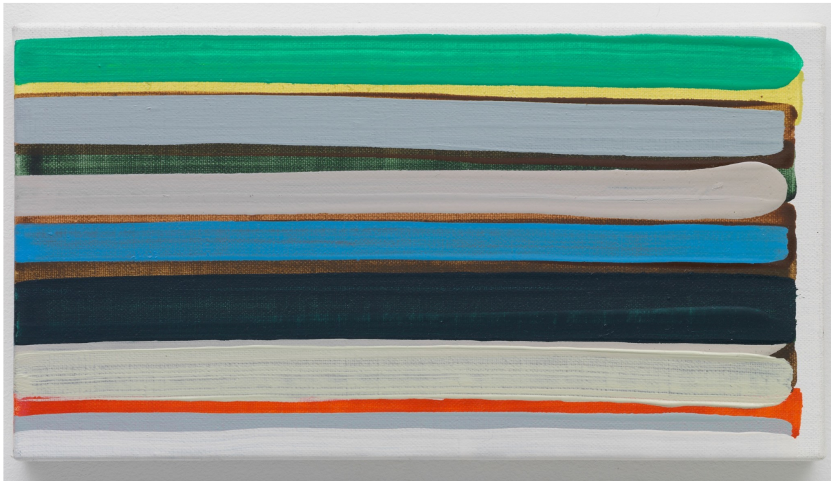
Yui Yaegashi's "White Line," 2016, oil on canvas, 4.7 inches by 9 inches. (Parrasch Heijnen Gallery.)

The soundless stillness that spills from Yaegashi's intimate abstractions has nothing to do with the silent authority of solemn situations or sacred spaces. It has, on the contrary, everything to do with those fleeting moments when you see something beautiful and your breath catches — not so long that you get lightheaded, but just long enough to notice that you are in the presence of something special.