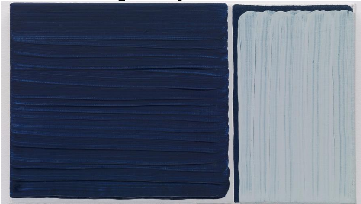
Yui Yaegashi's "Exchange," 2016, oil on canvas, 9.25 inches by 5.5 inches. (Parrasch Heijnen Gallery)