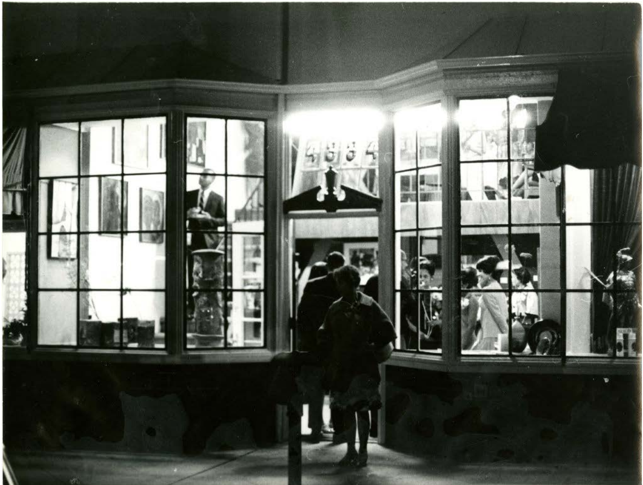
An exterior view of Brockman Gallery on the opening night of the first gallery exhibition in 1967. The gallery was located at 4334 Degan Boulevard in the Leimert Park neighborhood of Los Angeles.