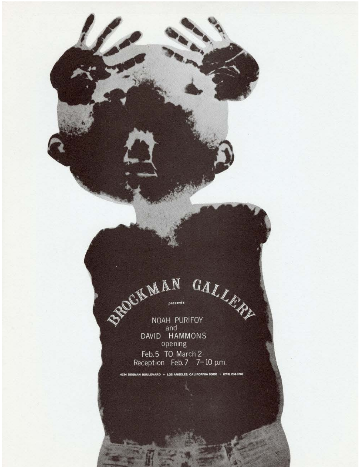
An undated poster for an exhibition at Brockman Gallery featuring the artists Noah Purifoy and David Hammons.