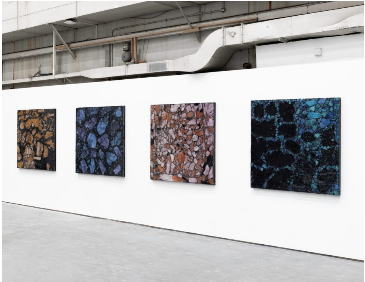
Alteronce Gumby's terrazzo works at False Flag's booth at the Sunday Art Fair in London.

Who: The Bronx-based artist, born in 1985, is showing new abstract works that transform fragments of colored glass into terrazzo panels that explore identity and how people rebuild their lives after traumatic events. Named after jazz compositions, Gumby's iridescent wall pieces pack plenty of what auctioneers call wall power. The young artist brings something new to the party thrown by similar artists, such as Jack Whitten, Sam Gilliam, and Robert Rauschenberg.