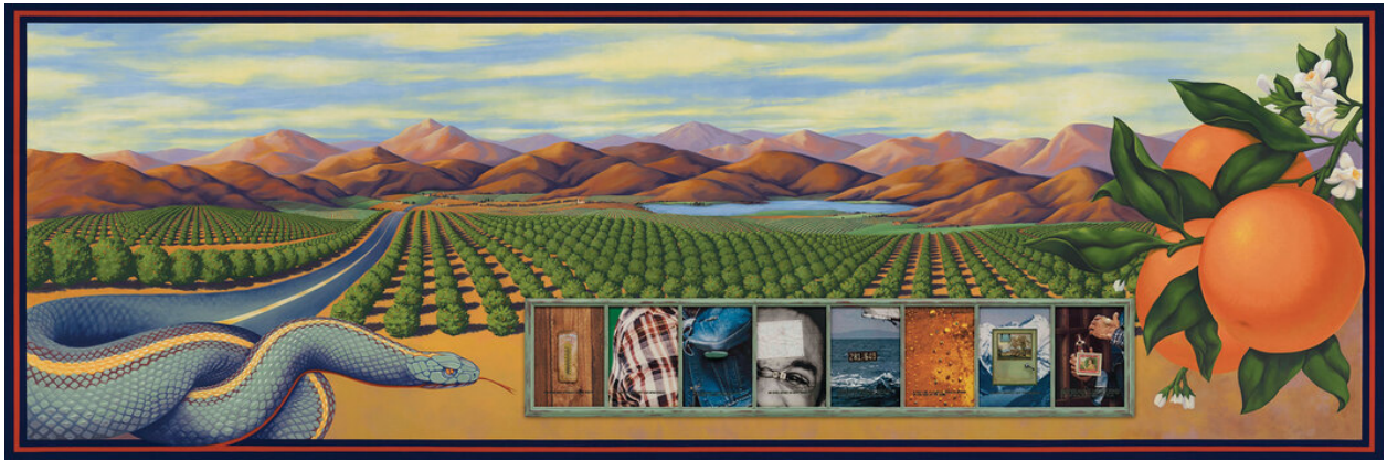
Alexis Smith, Same Old Paradise , 1987, eight mixed-media collages on house paint mural, overall 22 × 62'.

Travis Diehl on Alexis Smith's Same Old Paradise, 1987