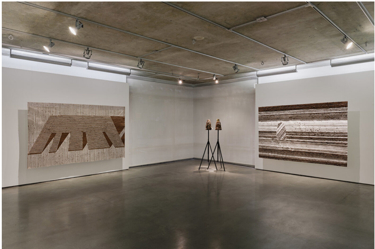
Installation view of Christine Howard Sandoval: A wall is a shadow on the land , Contemporary Art Gallery, Vancouver.

community projects. These are primarily white artists, from privileged backgrounds, who receive big grants to go into communities to which they don't belong and try to imagine ways to solve community problems such as access to water or electricity.