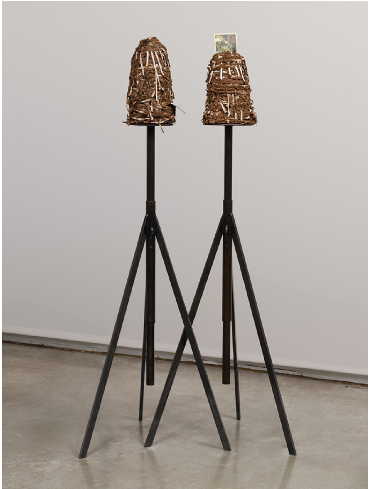
Christine Howard Sandoval, The Eaters , 2020, adobe mud, masking tape, postcard, steel, dimensions variable.