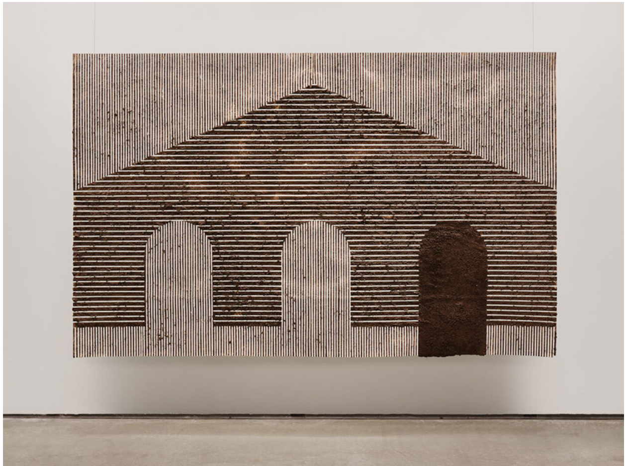
Christine Howard Sandoval, Arch—A Passage Formed By A Curve , 2020, adobe mud, graphite on paper, 60 ×96 inches.