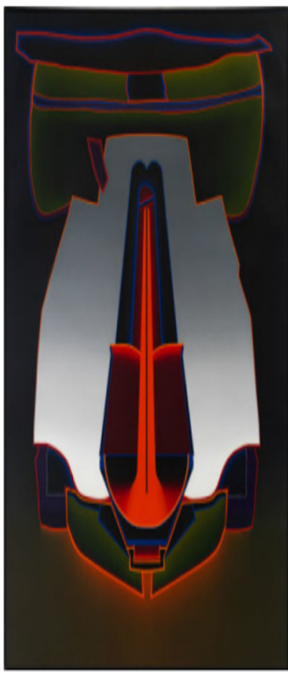
Deborah Remington, Memphis, 1969. Oil on linen, 60 x 53 inches.

whose purely visual elements feel both tangible and psychologically compelling. She paints hieratic forms that suggest machined devices, architectural diagrams, interiors of the body, shields, and emblems. In their ambiguity, the possibilities inherent in the imagery keep opening up multiple readings of exposed cross-sections, places of refuge, routes of escape, and at times, majestic flowerings.