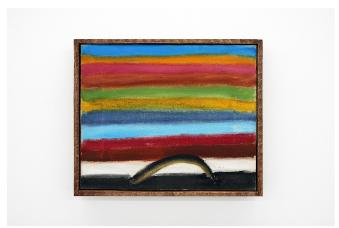
Forrest Bess, Untitled (Rainbow with Arc). Oil on canvas, 10 x 11.9 inches.