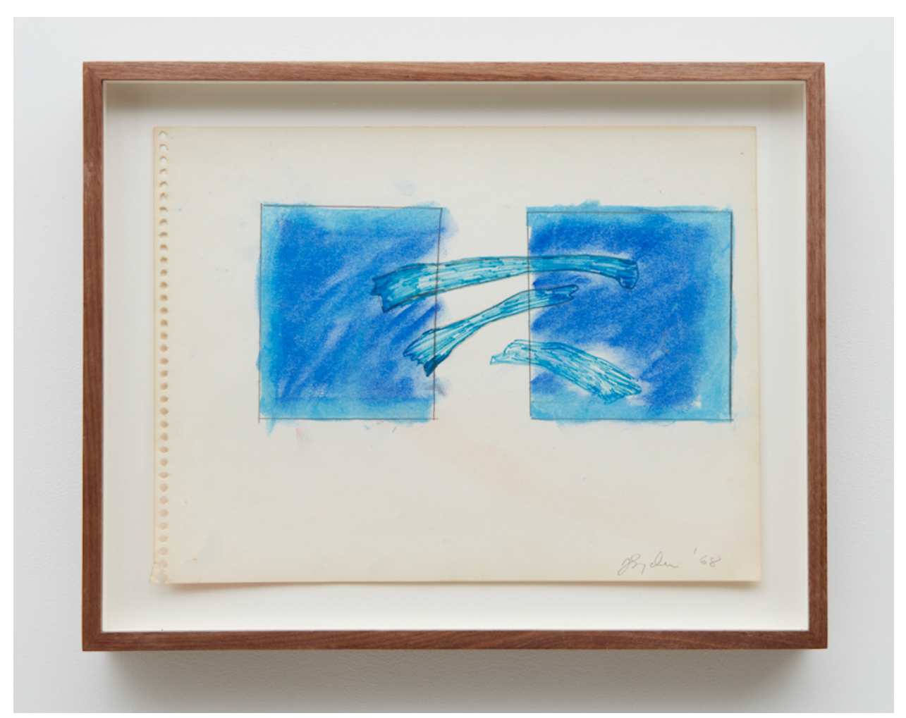
Joan Snyder, 2 Blue Boxes (1968). Pencil, pastel, and marker on paper, 11.5 x 14.5 inches.