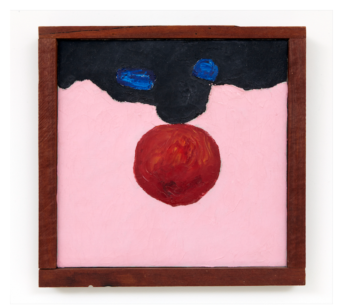
Forrest Bess, Untitled No. 6 (1957). Oil on canvas in artist's frame, 11.5 x 11.75 inches.