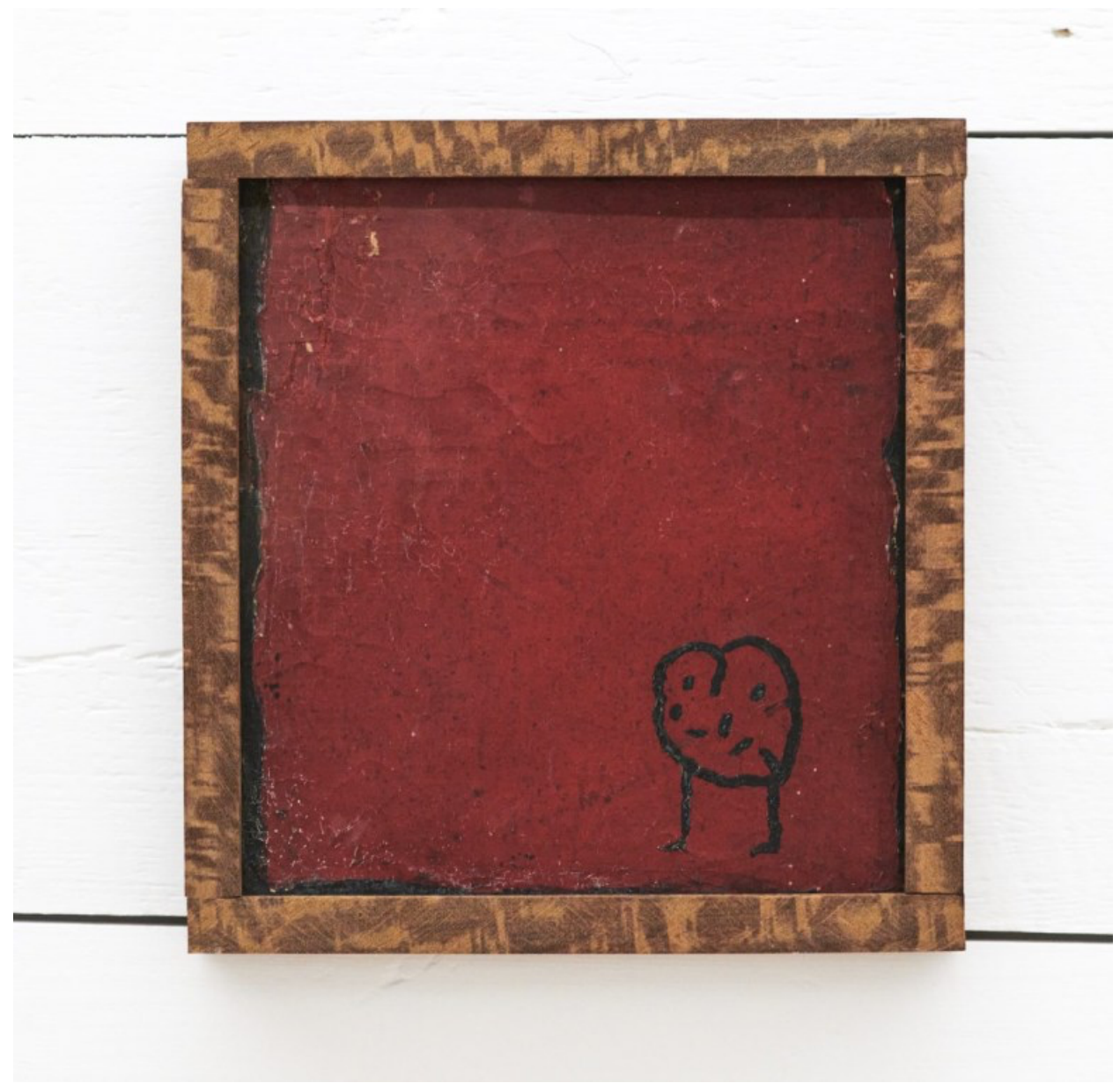
Forrest Bess, "Untitled" (n.d.), oil on canvas, 9.75 x 9 inches

The first thing that struck me about the paintings was that none of them looked familiar. If I had thought that they were variations on Bess's paintings, I would have become suspicious. There were recognizable Bessian symbols, like the "tree of life," and colors he had used in other works, such as gray and dark green, but they did