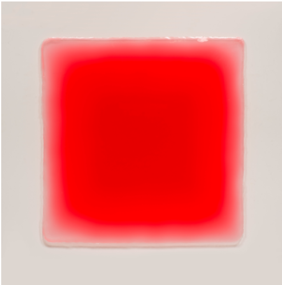
Peter Alexander, Big Red Puff, 2015 urethane 58 x 59 inches