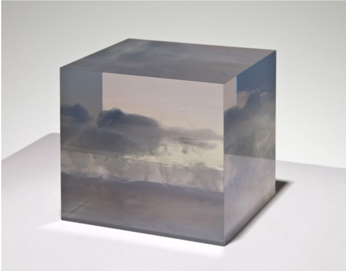
Peter Alexander Small Cloud Box, 1966 polyester resin 5 x 5 x 5 inches