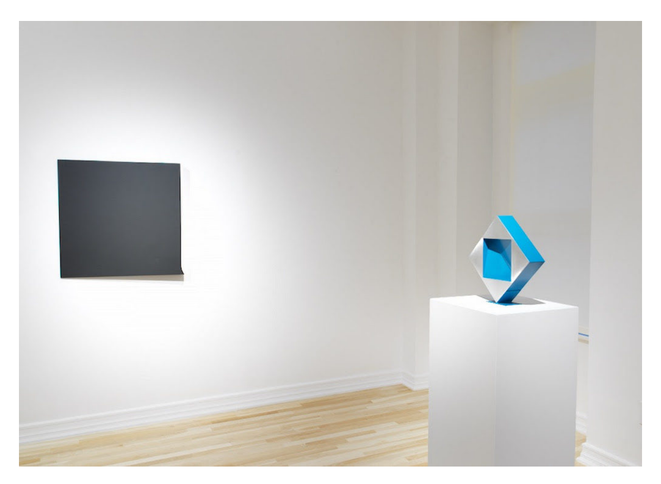
Installation view, from Tony DeLap: A Career Survey, 1963 – 2016, at Franklin Parrasch Gallery, NYC. 2017.

DELAP: Yes, one piece of wood, and it starts at ninety-degrees and then twists in toward the wall. That twist is hyperbolic. So it's very much like the endless column. For example, you take a piece of paper and twist it and bring it around again in a childlike image—a figure 8 or whatever the case may be.