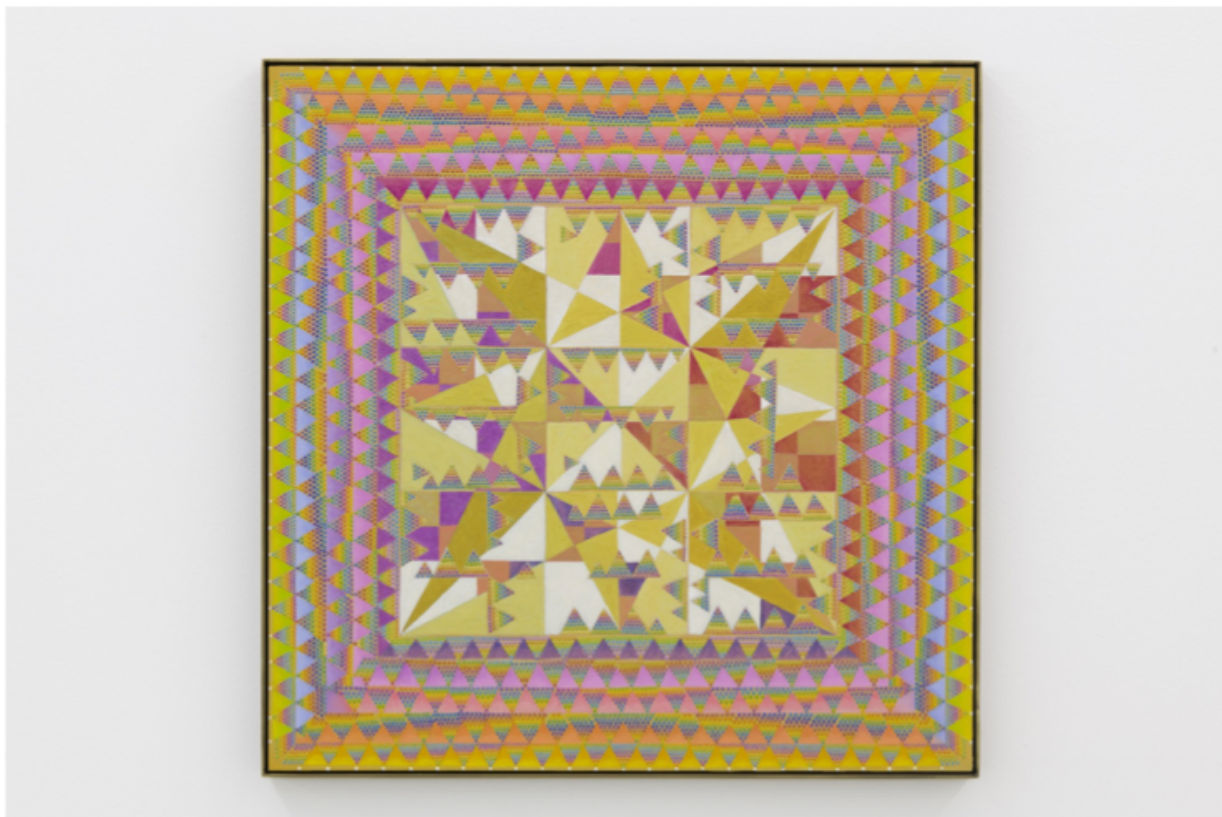
Xylor Jane, “Magic Square for Earthlings,” 2017. Oil and ink on board, 19.75 by 19.75 inches Parrasch Heijnen Gallery

Her third solo show in Los Angeles, “Magic Square for Earthlings,” is a tour de force of delicacy and nuance, its devotion and generosity putting visitors in touch with otherwise invisible patterns and rhythms that structure the cosmos while making us see that we are part of the mystery.