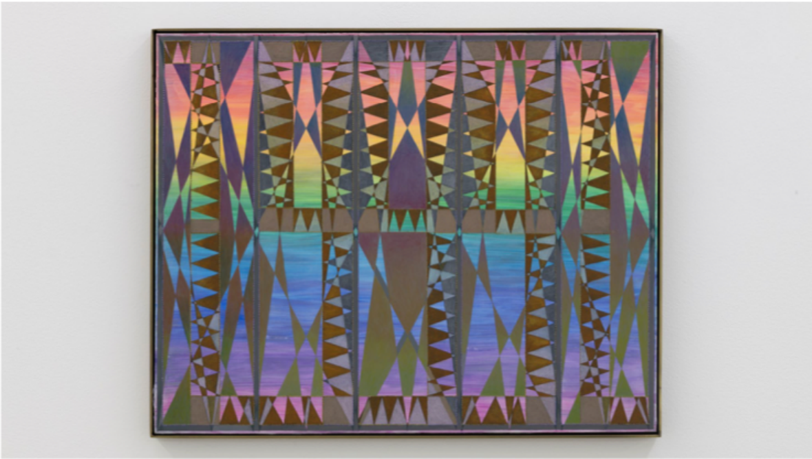
Xylor Jane, "91418," 2017. Oil on board, 16 inches by 20 inches. Parrasch Heijnen Gallery