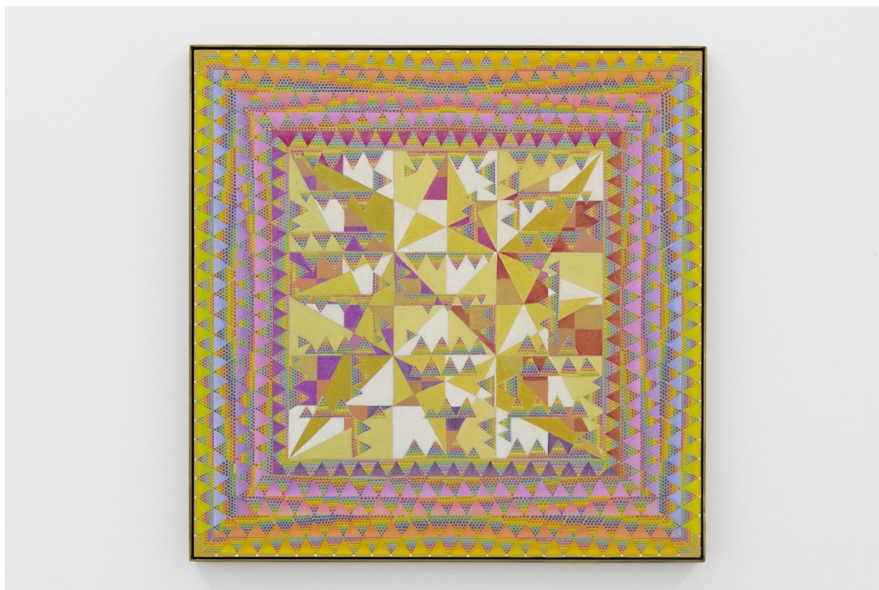
Xylor Jane, “Magic Square for Earthlings,” 2017. Oil and ink on board, 19.75 by 19.75 inches Parrasch Heijnen Gallery

No two of Jane’s 10 intimately scaled paintings look alike. Each changes radically as you move close and step away. That’s because the dots of paint Jane has applied are smaller than the head of a pin and pointed, like the pin’s business end. They cast mini shadows.