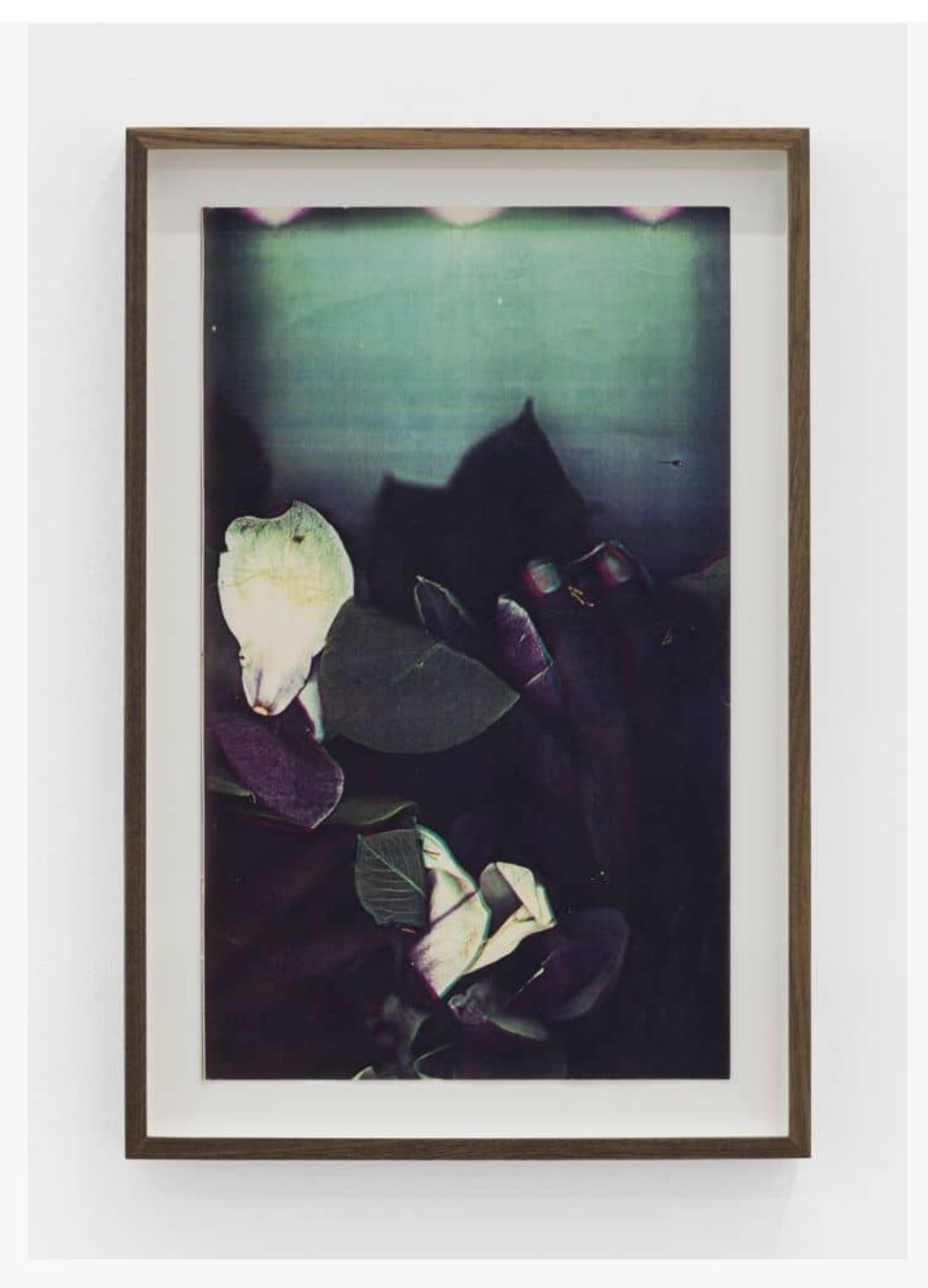
Untitled, 1980 color Xerox photo collage 14 x 8-1/2 inches