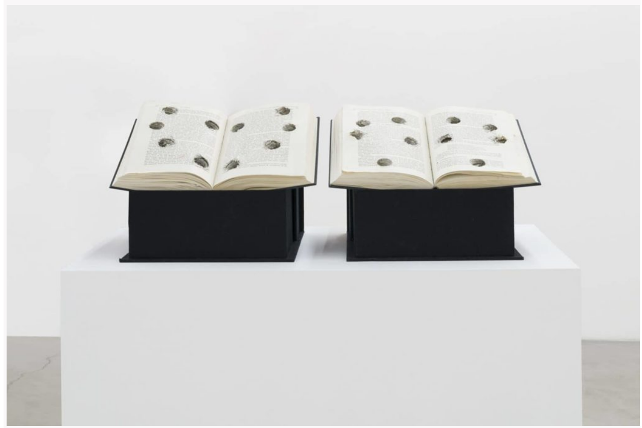
Volume I & II: The History of the United States with a few Parts Missing, 2007 modified books with holding cases 13-1/4 \times 9-1/2 \times 2-1/2 inches each

In a work from 2007, Volume I & II: The History of the United States with a few Parts Missing , Howard engages with the stories of those forced from overseas. According to the artist, the work took form by chance. She had been drilling random holes into books when she came across the history book The United States Since 1865 . When she opened it up, she discovered that the holes surrounded the poem The New Colossus by Emma Lazarus, where she calls: "Give me your tired, your poor, Your huddled masses"