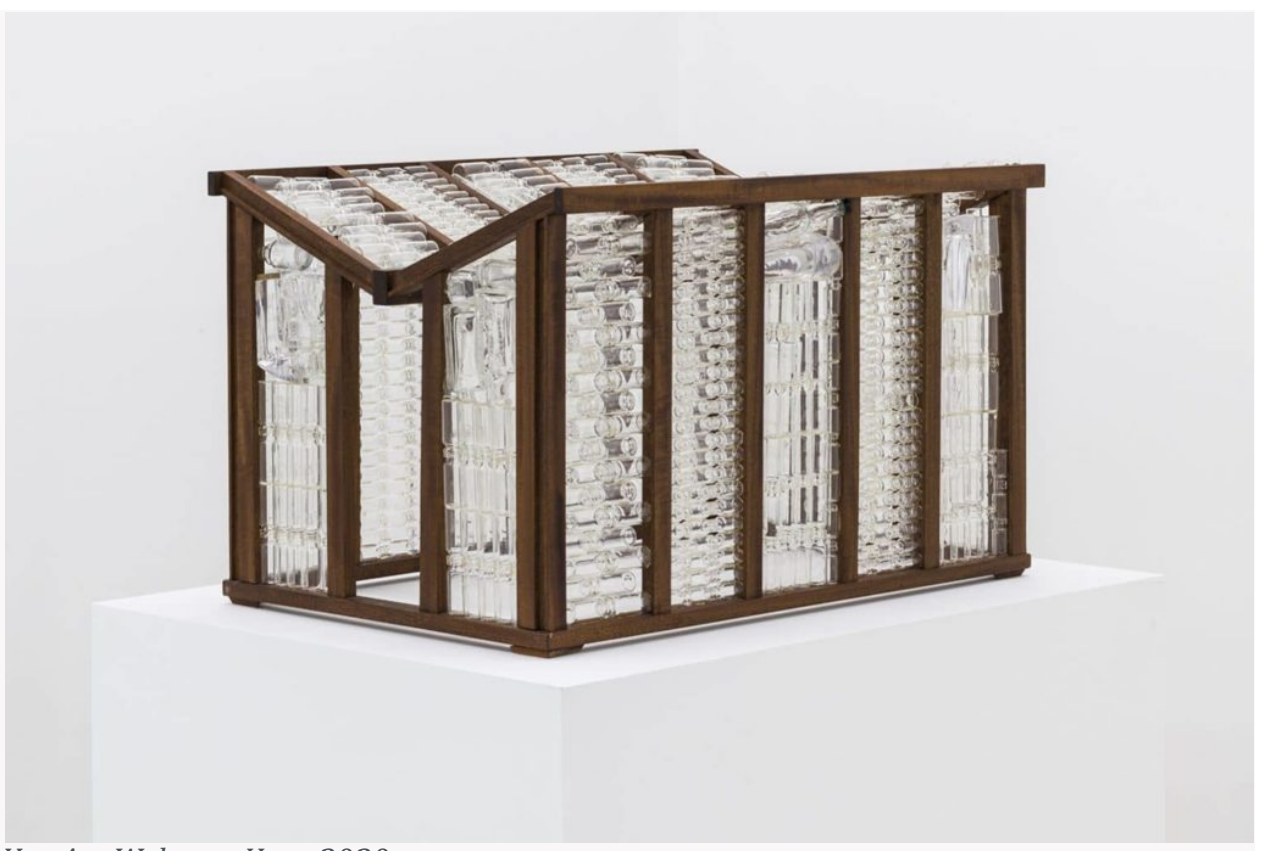
You Are Welcome Here, 2020 found glass bottles, wood, glue 17-1/2 x 28-1/2 x 18-7/8 inches

In examples of most recent work, Howard has created sculptures of model houses. These are composed of wood frames with the walls filled by glass bottles she collected. According to the gallery's press release, these are a combine of Joseph Eichler's modernist architecture and a model of slave quarters. Eichler was a Californian architect and real estate developer in the mid-1900s who designed and sold homes with a strict non-discrimination policy. His designs were often open and airy, with ample light allowed in through windows and skylights. The glass bottles in Howards' models suggest that those once treated as slaves have a home to enter and bathe themselves in the light of their interiors. The refractions of light from the bottles cause the entire dwelling space inside to glow.