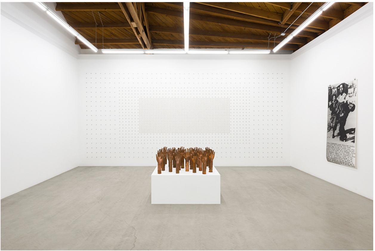
Ten Little Children Standing in a Line (One Got Shot, and Then There Were Nine), 1991 Mixed media installation (brass bullet casings, copper glove molds, photomural), dimensions variable.