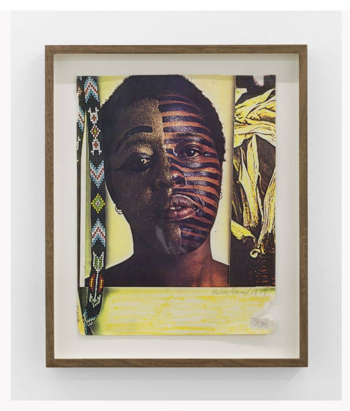
Untitled, 1979 color Xerox photo collage 11-7/8 x 8-3/8 inches

In a third collage, Untitled (1979), a face appears—of the artist herself. Her face is shown half-painted on one side with stripes and the other in speckled gold. She is bordered by a hand-braided strap and a fabric print