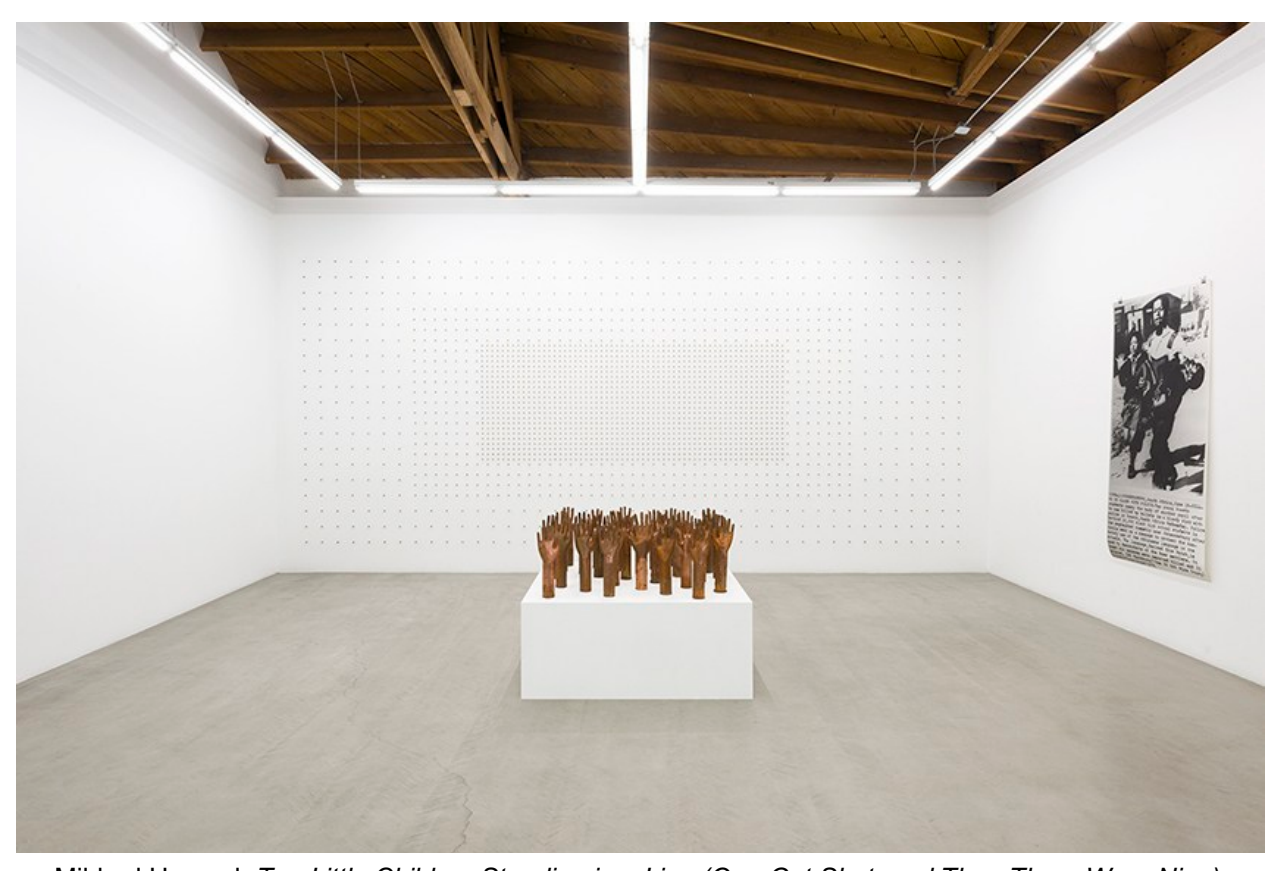
Mildred Howard, Ten Little Children Standing in a Line (One Got Shot, and Then There Were Nine) (1991). Mixed media installation (brass bullet casings, copper glove molds, photomural), dimensions variable.