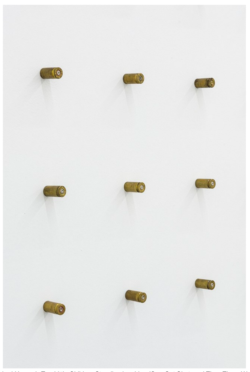
Mildred Howard, Ten Little Children Standing in a Line (One Got Shot, and Then There Were Nine) (detail) (1991). Mixed media installation (brass bullet casings, copper glove molds, photomural), dimensions variable.