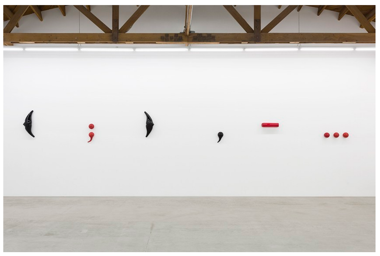
Mildred Howard, Parenthetically Speaking…It's Only a Figure of Speech (installation view) (2010) Hand blown glass, 9 pieces, dimensions variable.