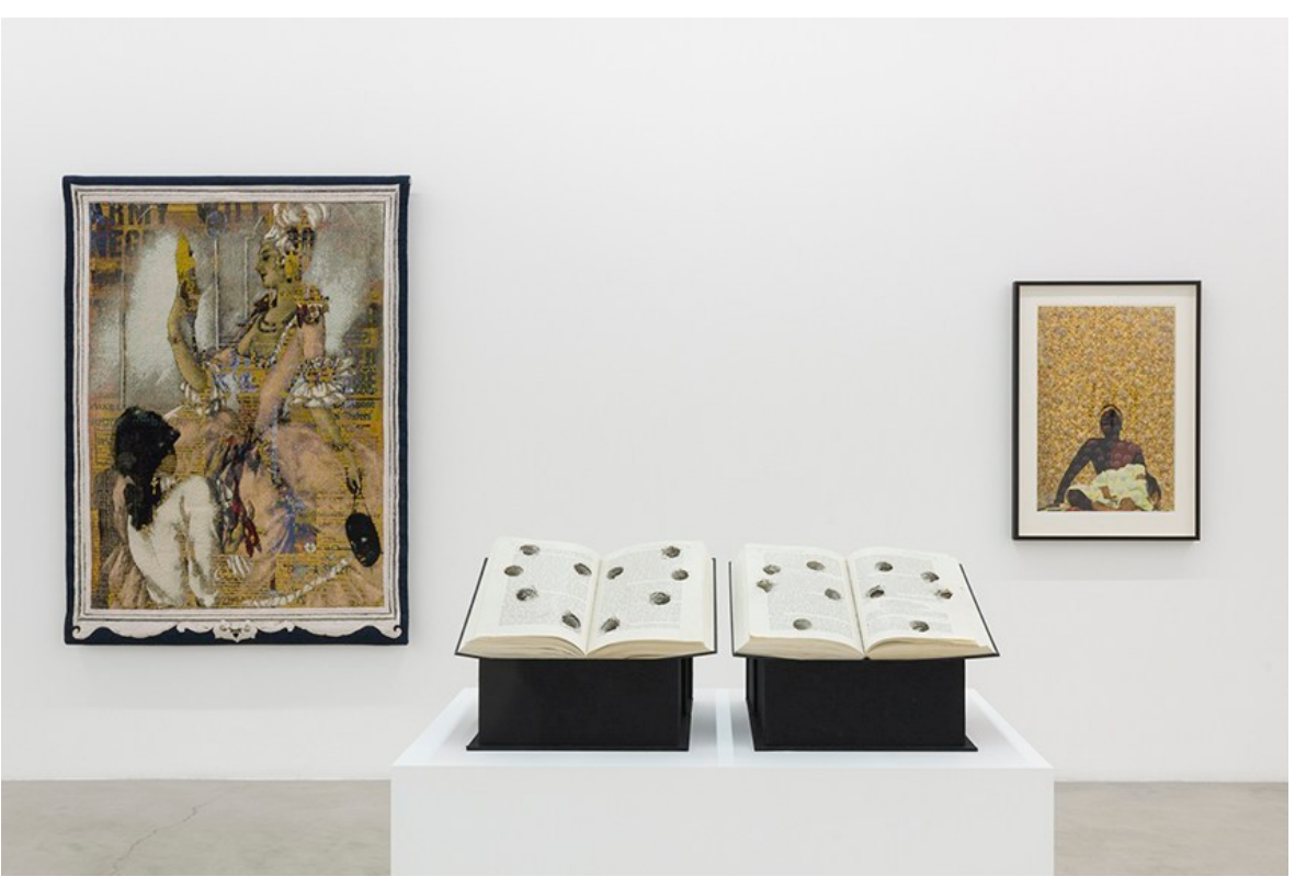
Mildred Howard: A Survey, 1978 – 2020 (installation view).